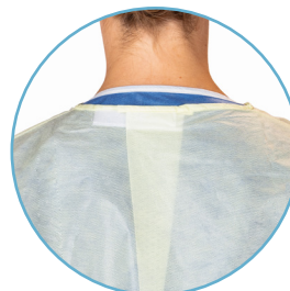
Hook and Loop Closure