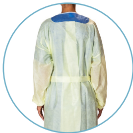
Full Coverage & Non-protective Back