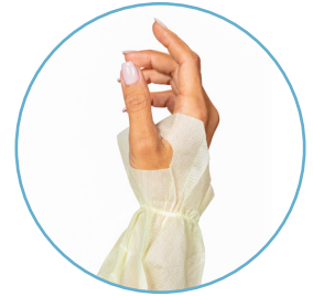
Elastic Wrist w/ Thumb Loop