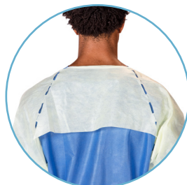
Over the Head