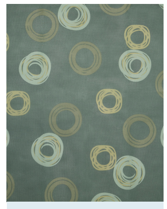
Circles Curtain ICP-6100Circles