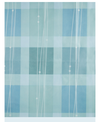
Winter Curtain ICP-6100Winter

Rapid Refresh<sup>®</sup> Privacy Curtains are as aesthetic as they are functional. Designed to fit any decor, choose from these standard colors and patterns to complement your environment.