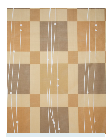
Fall Curtain ICP-6100Fall