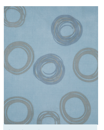
Sky Curtain ICP-6100Sky