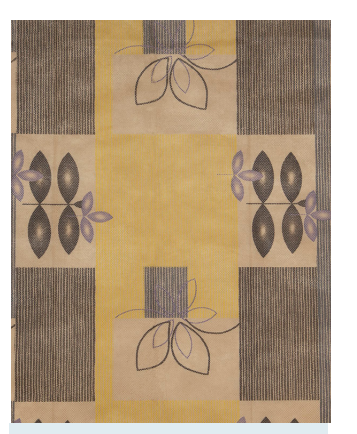
Beige Pattern ICP-6100BP