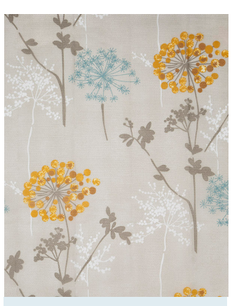
Teal Flower ICP-6100TF

All Patterns FSS: V797d-60703 MSPV: 36C24123A0029