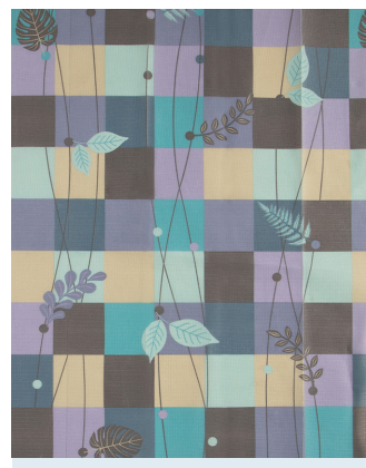
Fern Curtain ICP-6100Fern

Department of Defense DAPA IA: IAN-2211-02 includes Winter, Circles and Beige Pattern