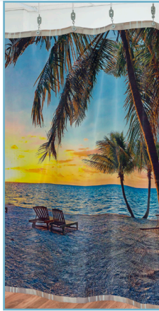
Armor/ Sereneview® Curtains