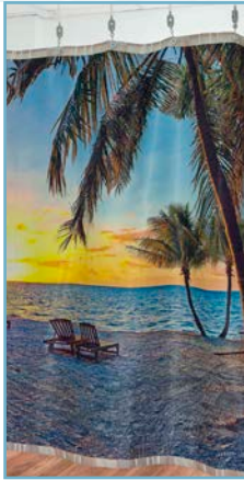
Armor/ Sereneview® Curtains